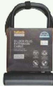
Halfords Advanced D-Lock