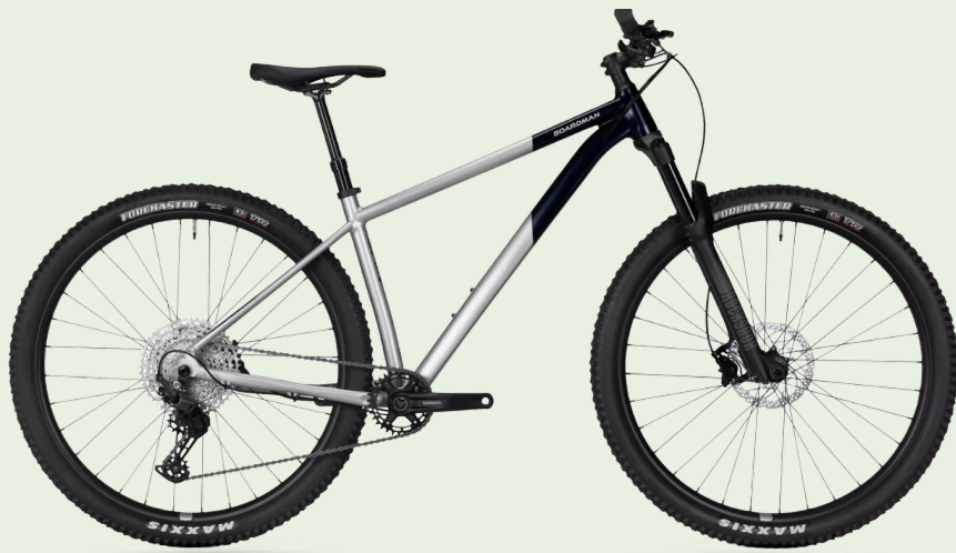
Boardman MHT 8.9 Performance mountain bike